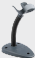
• STD-QD24-BK Stand, Black