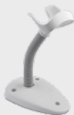
• STD-QD24-WH Stand, White