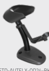
• STD-AUTFLX-QD24-BK Autosense Flex Stand, Black