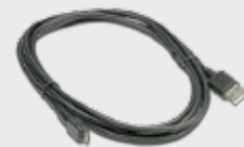
• 007100100 Direct Charging Cable